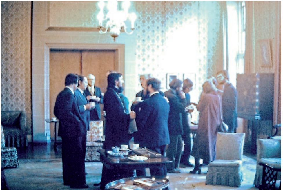
. The EYCE Executive entertained to tea at Lambeth Palace by Archbishop Donald Coggan (right in the middle of the picture)

In 1973, as freshly appointed Youth Secretary for the new URC, I found myself driving a minibus full of British Council of Churches (BCC) & denominational youth officers across Europe to Berlin. We weathered Checkpoint Charlie (remember those were still very much cold war days) and journeyed on to Hirschluch, a conference centre in Storkow, not far from the Polish border, where EYCE was holding its annual General Meeting.