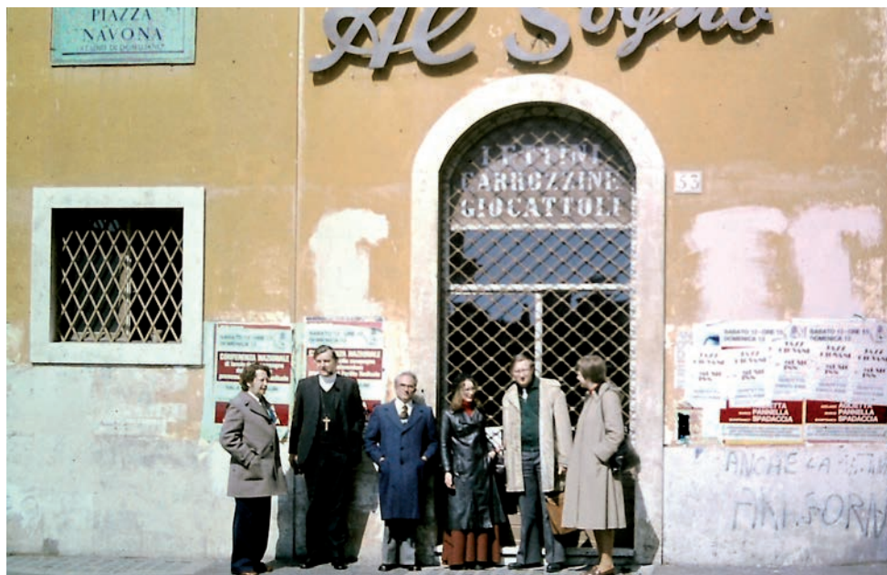
EYCE Executive members outside the Baptist Chapel in Rome after leading worship (I had to preach!)

That was a fascinating and to an extent life-changing experience. I spent six years involved with EYCE, including a spell on its Executive and attended meetings from Odessa in USSR to Joensuu in Finland, from Pinner (yes Middlesex) to Rome. I could bore you for hours with tales of all that – but I won't.