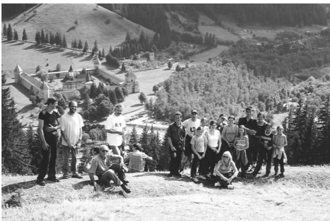
Romanian youth with one of the monasteries near Radauti.