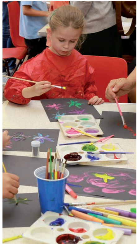
Messy Church helps to decorate the letters