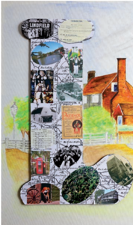
L, our first Letter