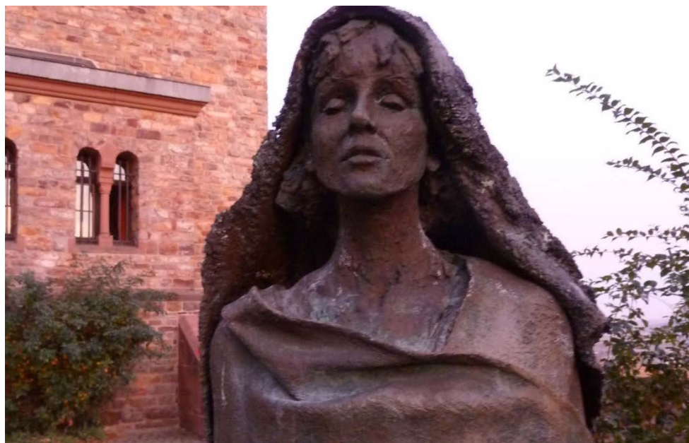
Statue of St Hildegard in the gardens around the Abbey: