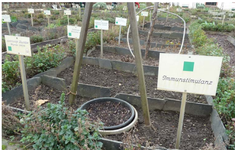
Herbs selected by St Hildegard for stimulating the immune system: