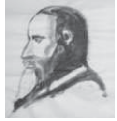
Sir Leslie Stephen

therefore with gladness that he saw his youngest son, Leslie Stephen, go up to Cambridge and read for ordination. He anticipated that by his study of theology, Leslie would be able to bolster his confidence that the old certainties were still certain.