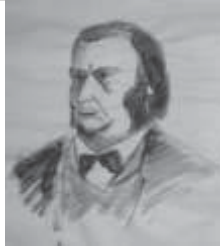
Sir James Stephen